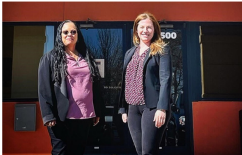
New Mexico Legal Aid - Silver City office

"Advocates at New Mexico Legal Aid work every day with victims of domestic violence, families - many with children - at risk of homelessness, people who become indebted to predatory lenders, and people suffering many other kinds of legal catastrophes. The money we receive from Equal Access to Justice provides essential support for all the work we do for low-income New Mexicans and helps our efforts to expand services to meet the increasing need across our state."