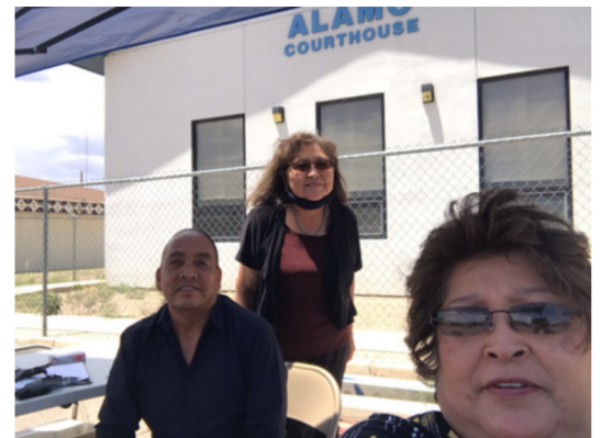
DNA People's Legal Services Outreach and Intake in Alamo

"At DNA People's Legal Services, we use EAJ funding to help families with legal needs that have devastating consequences if unaddressed - denials of rightful health and financial benefits for the disabled and unemployed; unlawful evictions and repossessions; physical and financial exploitation and abuse; unsafe housing conditions; and discrimination at work. In our extremely rural and remote service area, EAJ funds provide an attorney for those who need one to secure safety, stability, and a measure of dignity in their lives. "