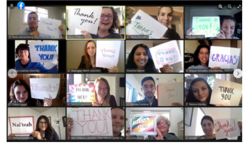
The New Mexico Center on Law and Poverty

"We could not do our work without the support of New Mexico's legal community and Equal Access to Justice. These resources are essential to advancing system-wide changes for the health and well-being of our children and families and help the New Mexico Center on Law and Poverty respond quickly and directly to community priorities."